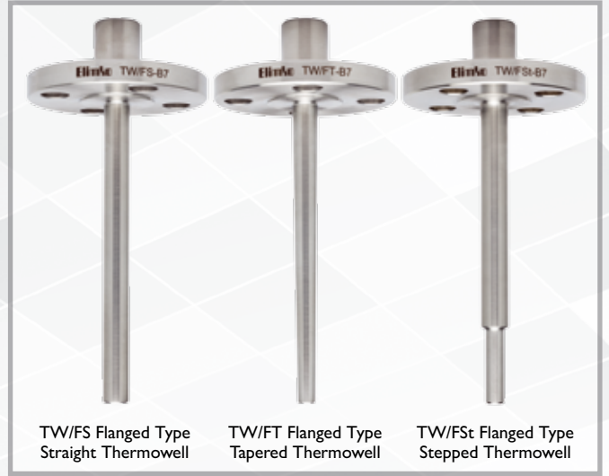
TW/FS Flanged Type Straight Thermowell TW/FT Flanged Type Tapered Thermowell TW/FSSt Flanged Type Stepped Thermowell