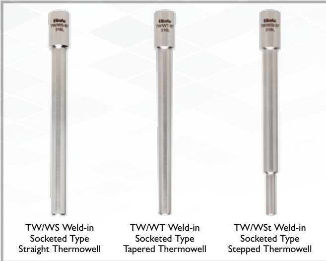
TW/WS Weld-in Socketed Type Straight Thermowell TW/WT Weld-in Socketed Type Tapered Thermowell TW/WSSt Weld-in Socketed Type Stepped Thermowell