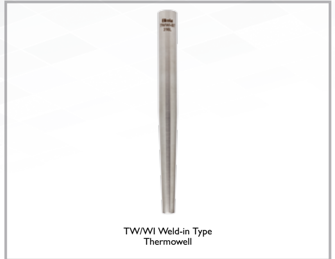
TW/WI Weld-in Type Thermowell