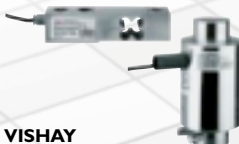
VISHAY (Revere, Teda (T&H) Celltron, Sensontronics) ASCELL

Ph/redox meters, conductivity dissolved oxygen, water analyzers silica monitor, turbidity analyzer and sensors.